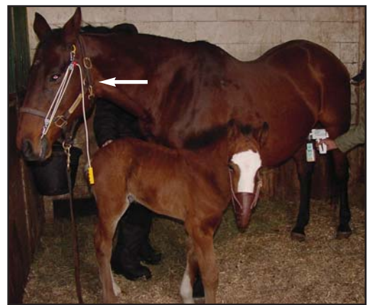
The Stableizer<sup>®</sup> and Udderly EZ<sup>™</sup> Milker working together.